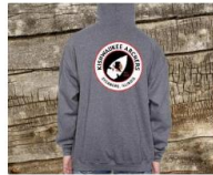
Kishwaukee Archers Hooded Swe... $24.99 FREE shipping