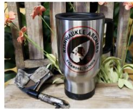
Kishwaukee Archers Travel Mug $12.00 FREE shipping