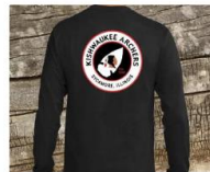
Kishwaukee Archers Long Sleeve T... $18.99 FREE shipping

The store has been on a very long (sort break). Contact Dustin Wiepert at (815) – 520-6975 or Wiepert1927@yahoo.com for all your orders.