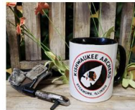
Kishwaukee Archers Coffee Mug $8.00 FREE shipping