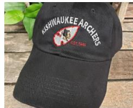
Kishwaukee Archers Club Hats $19.99

https://www.etsy.com/shop/KishArchersStore