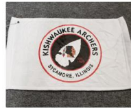
Kishwaukee Archers Towel $7.00 FREE shipping