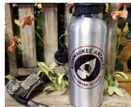
Kishwaukee Archers Water Bottle $12.00 FREE shipping