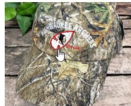
Kishwaukee Archers Club Hats $19.99 FREE shipping