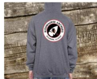
Kishwaukee Archers Zip Up Hoodie... $29.99 FREE shipping