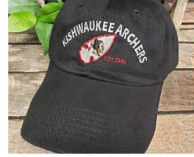
Kishwaukee Archers Club Hats $19.99 FREE shipping

https://www.etsy.com/shop/KishArchersStore