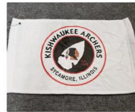
Kishwaukee Archers Towel $7.00 FREE shipping