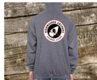
Kishwaukee Archers Zip Up Hood... $29.99 FREE shipping