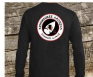
Kishwaukee Archers Long Sleeve T... $18.99 FREE shipping

The store has been on a very long (sort break). Contact Dustin Wiepert at (815) – 520-6975 or Wiepert1927@yahoo.com for all your orders.