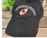
Kishwaukee Archers Club Hats $19.99

https://www.etsy.com/shop/KishArchersStore