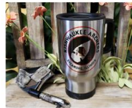
Kishwaukee Archers Travel Mug $12.00 FREE shipping