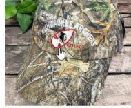
Kishwaukee Archers Club Hats $19.99 FREE shipping