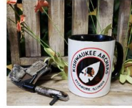
Kishwaukee Archers Coffee Mug $8.00 FREE shipping