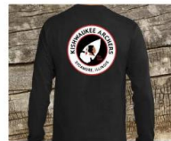
Kishwaukee Archers Long Sleeve T... $18.99 FREE shipping

The store has been on a very long (sort break). Contact Dustin Wiepert at (815) – 520-6975 or Wiepert1927@yahoo.com for all your orders.