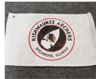
Kishwaukee Archers Towel $7.00 FREE shipping