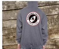
Kishwaukee Archers Hooded Swe... $24.99 FREE shipping