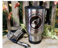
Kishwaukee Archers Travel Mug $12.00 FREE shipping