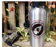
Kishwaukee Archers Water Bottle $12.00 FREE shipping